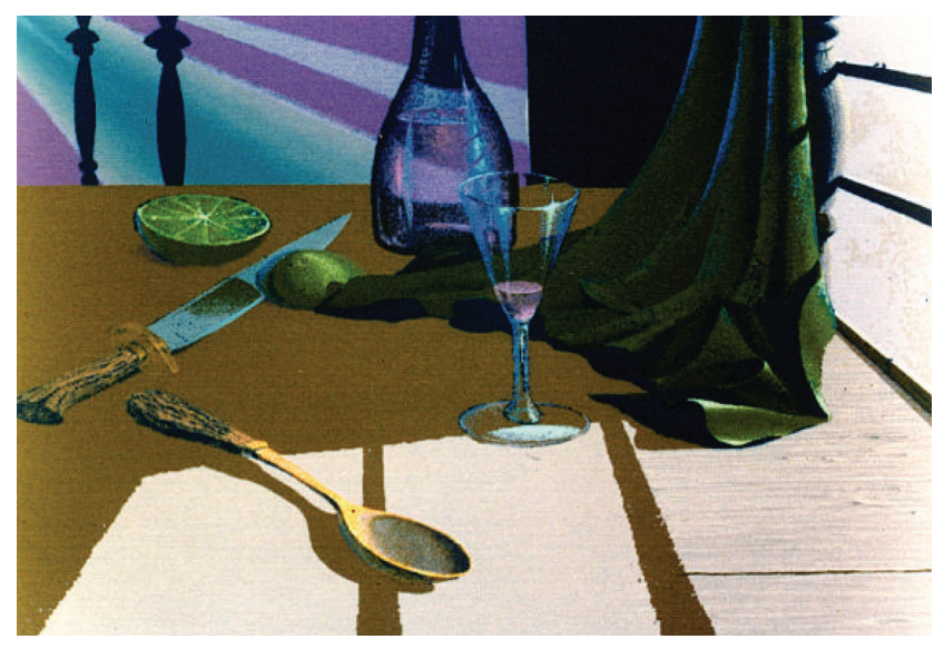
Figure 5. A 1977 still life by Paul Xander, one of his first uses of the 8-bit program BigPaint for high-resolution paintings. The original resolution of this painting was 1024 \times 972 pixels with a 4:3 aspect ratio.

is seldom used as seen from the computer's viewpoint. So all of the station computers were to talk to Christie's central computer that would handle all the tablet traffic and pass only pertinent information to the stations. We would call her machine a tablet "server" today.