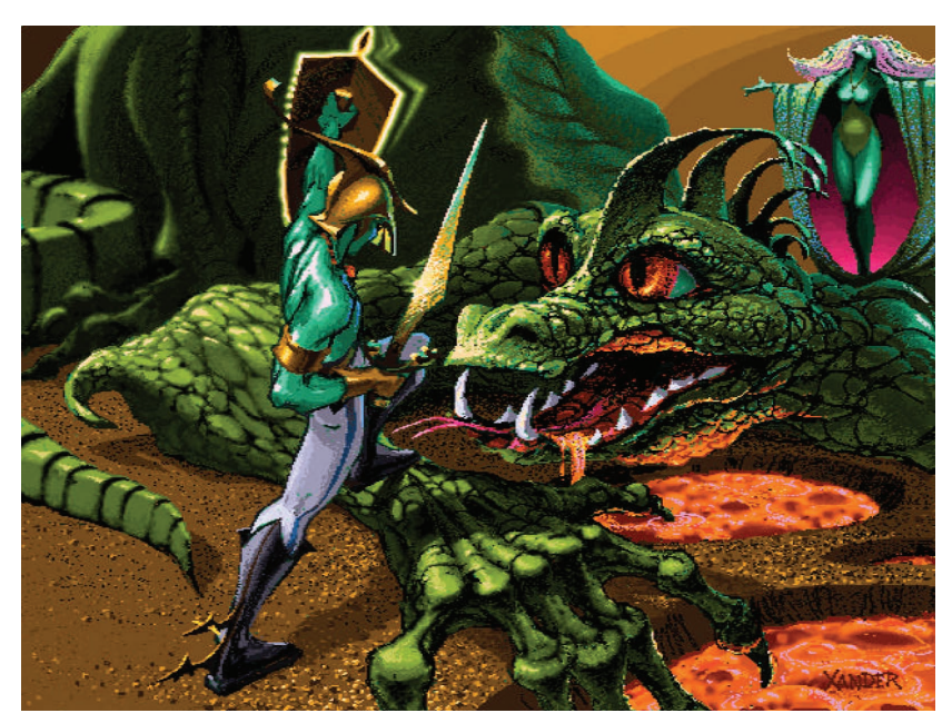
Figure 4. An early (1975) painting on the 8-bit Paint program by Paul Xander (signature at lower right), a professional background artist for whom the program was largely designed. The original was 512 \times 486 pixels at the 4:3 aspect ratio of ordinary television.

tor (Three Rivers Graphic Wonders, except for the E&S Picture System at one station), and a frame buffer (E&S). The idea was to offload the work of listening to the tablets to a separate machine (a DEC PDP 11/34). The computer cycles in 1976 were so precious that it was a crime to have many of them used simply to listen to the tablet, which